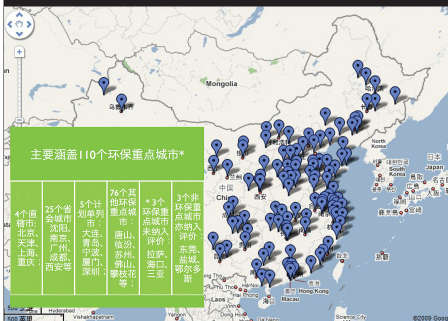
Figure 1: PITI Assesses Environmental Transparency of 113 Chinese Cities

Our analysis of cities throughout China's eastern, central, and western regions revealed important progress toward environmental information transparency. A number of cities have been active in developing various ways to disclose pollution data. Weihai in Shandong Province, for example, was the first city in China to post hourly pollution data, transmitted from online monitoring systems installed in major pollution sources, for public viewing. In Liaoning Province, major cities such as Shenyang have created a search function on their local environmental protection bureau websites, making information more accessible to the public. In response to our request for information, the city of Hefei in Anhui Province published its list of pollution violators on its website to improve compliance and public access to information. Of those cities that have been most proactive, Shanghai, Ningbo, Taiyuan, and Wuhan (Figure 2) have begun to provide systematic disclosure of violations by corporations; Beijing, Chongqing, Fuzhou, and Jiaozuo have demonstrated their commitment to transparency by disclosing information on the handling of petitions and complaint cases; and cities such as Hefei, Qingdao, Kunming, and Zhengzhou have scored highly in their responsiveness to requests for information disclosure.