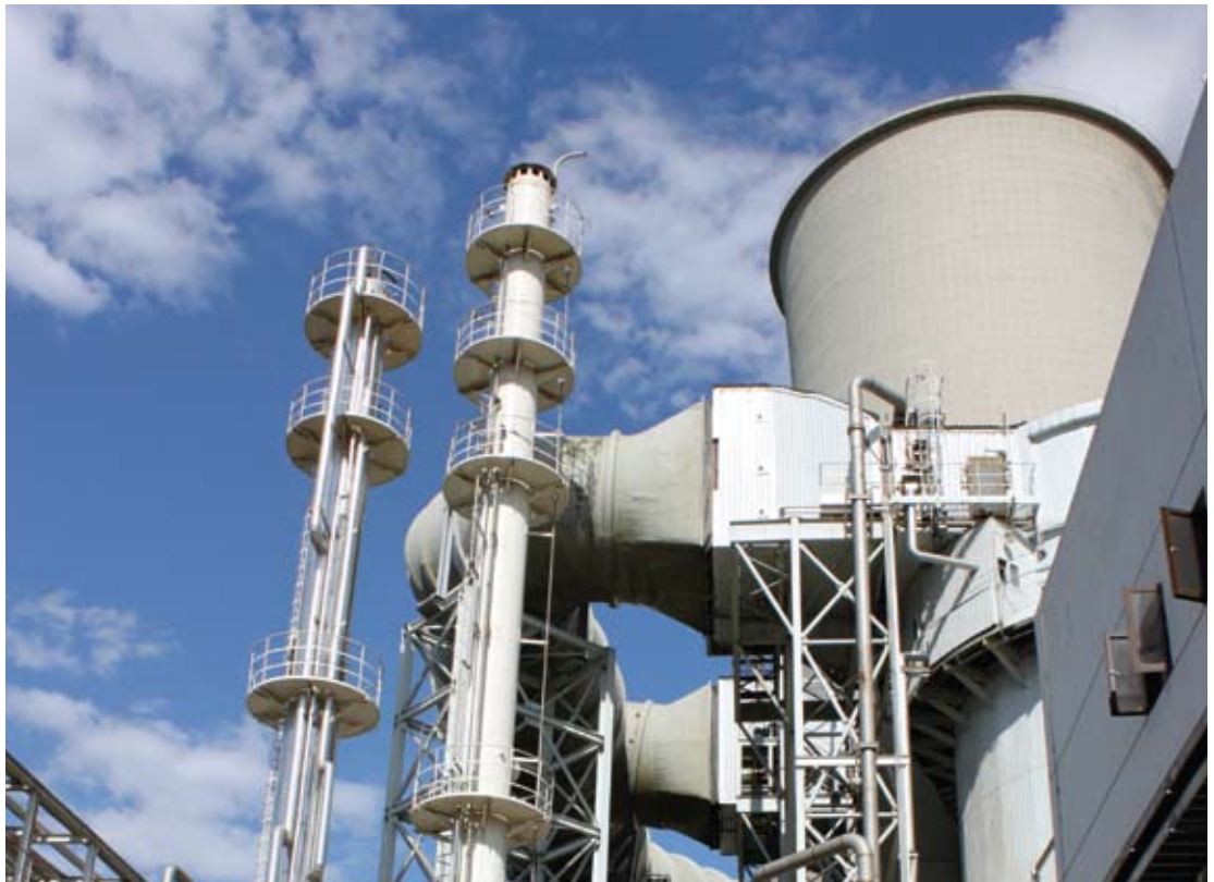
Beijing Gaobeidian coal power plant with a pilot carbon capture facility